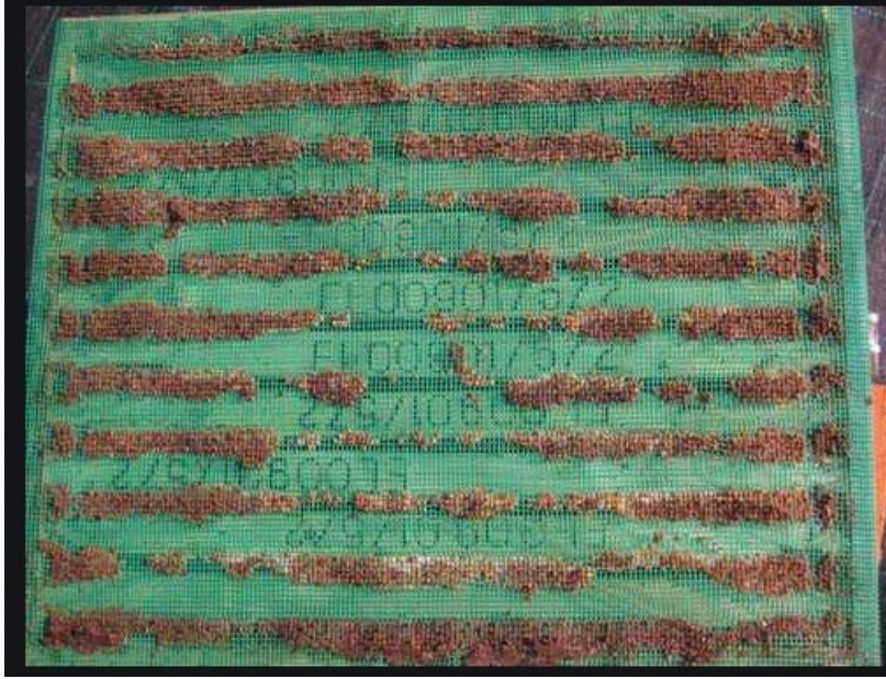
Figure 9: Propolis Trap Made from Construction Cloth