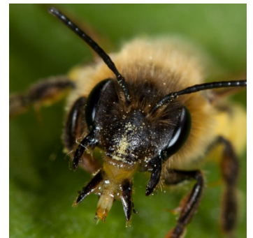
Figure 3: Honeybee Mouth Parts