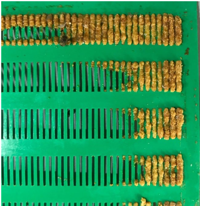
Figure 10: Plastic Propolis Trap