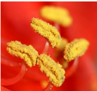
Figure 1: Plant Pollen

Bee Pollen is plant pollen + nectar + enzymes from a worker bee's head: