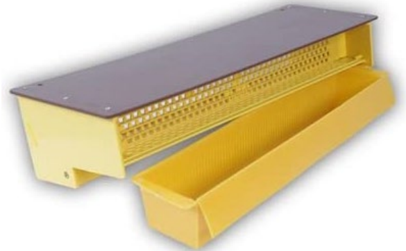
Figure 6: Entrance Pollen Trap