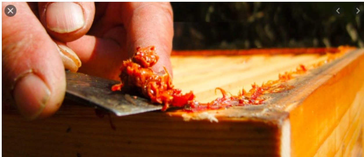
Figure 8: Collecting Propolis from a Live Beehive