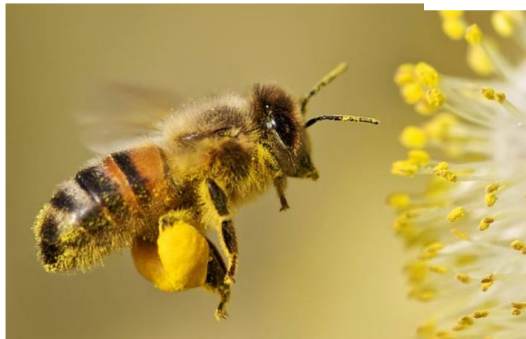
Figure 4: Bee Pollen

Bee Pollen is a highly nutritious protein food consumed by worker bees to manufacture royal jelly, to build muscle and strengthen their exoskeleton, and to produce venom.