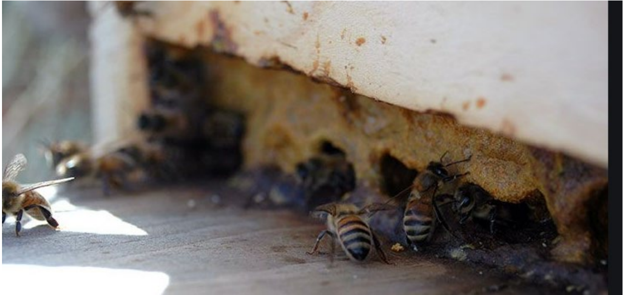
Figure 8: Propolis at the Hive Entrance

Honeybees use propolis to seal the hive off from wind and rain and to protect the hive from disease by coating brood cells before the queen lays eggs and by encasing dead mice and other intruders that cannot be removed.