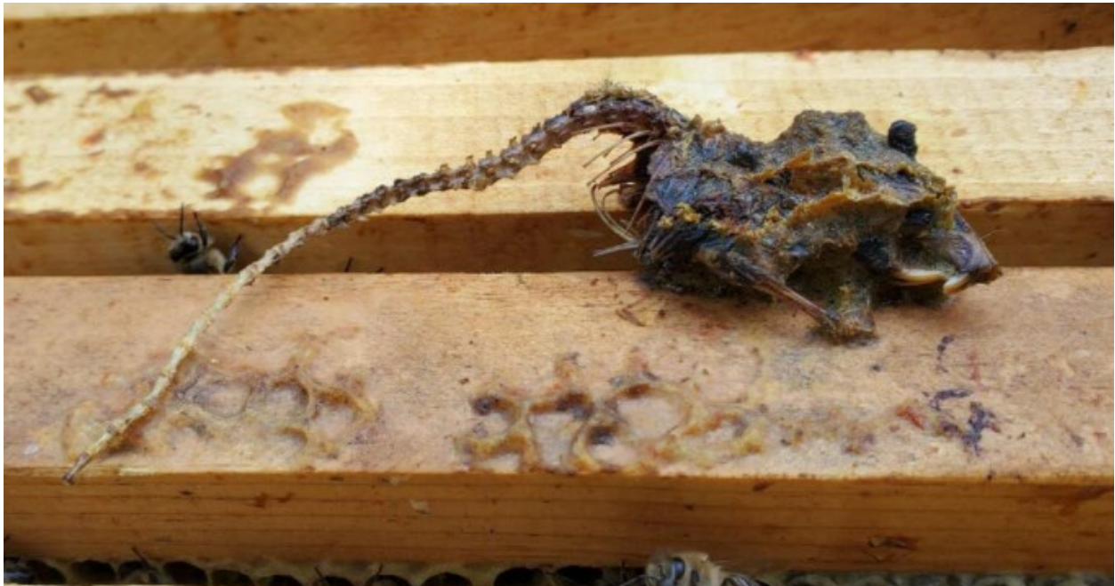
Figure 9: Propolis Encased Mouse