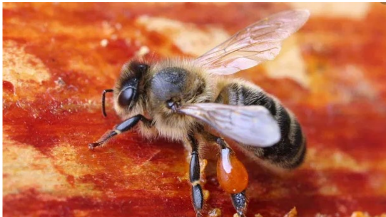
Figure 7: Honeybee Carrying Plant Resin

Propolis is plant resin, beeswax, and enzymes from a worker bee's head. Plant resin is gathered and transported by worker bees in much the same manner as bee pollen: