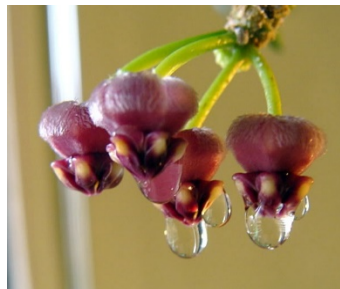
Figure 2: Plant Nectar